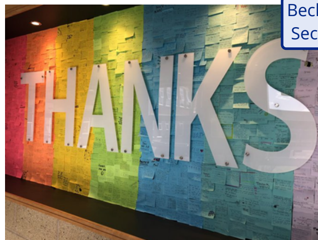
Beckfoot Thornton Secondary School

Data submitted by email through this form will be processed by Marks and Spencer and Freuds Bazaar .